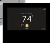
90% Gas Furnace

Ion Black System Control – Our innovative Ion Black System Control includes full-color touch screen technology for intuitive and powerful command over temperature, humidity, comfort scheduling, energy management and more.